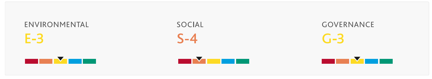
Exhibit 4 ESG issuer profile scores

Barclays Bank's CIS-3 indicates limited impact of ESG considerations on the ratings to date, with the overall assessment largely reflecting our industry view of the opacity, complexity and tail risks inherent to capital market activities captured under our governance assessment. The bank's track record in managing these risks and its strong financial fundamentals are important mitigating factors to this exposure.